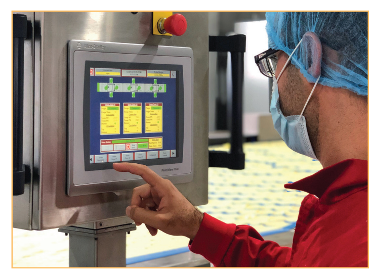
An intuitive touchscreen system enables precise, automated production and quality control.

As its consultations with RBS continued, Difco Group learned that the equipment manufacturer could also provide product and recipe development at the company's Science & Innovation Center. Located at the Reading Bakery Systems' U.S. headquarters in Robesonia, Pennsylvania, the Science &